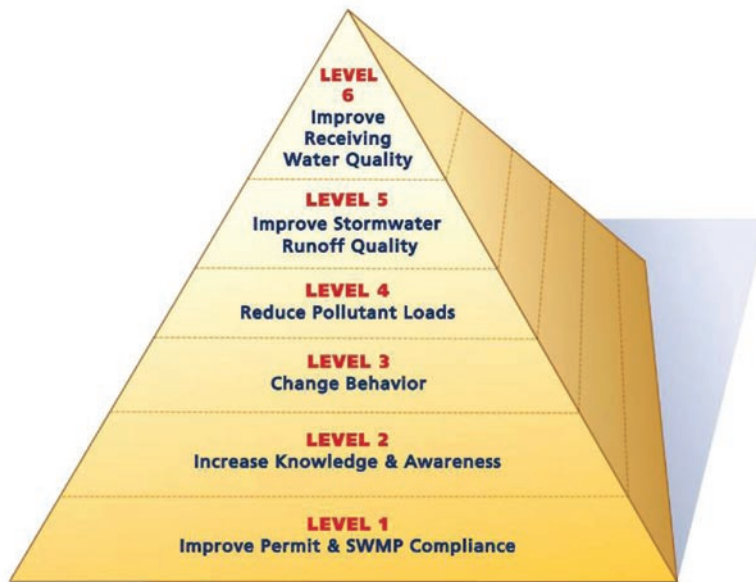
Figure 2. Program Effectiveness Assessment 9

The outcome levels assist in categorizing and gauging the performance of the stormwater management program. Important points to consider about effectiveness assessments include: