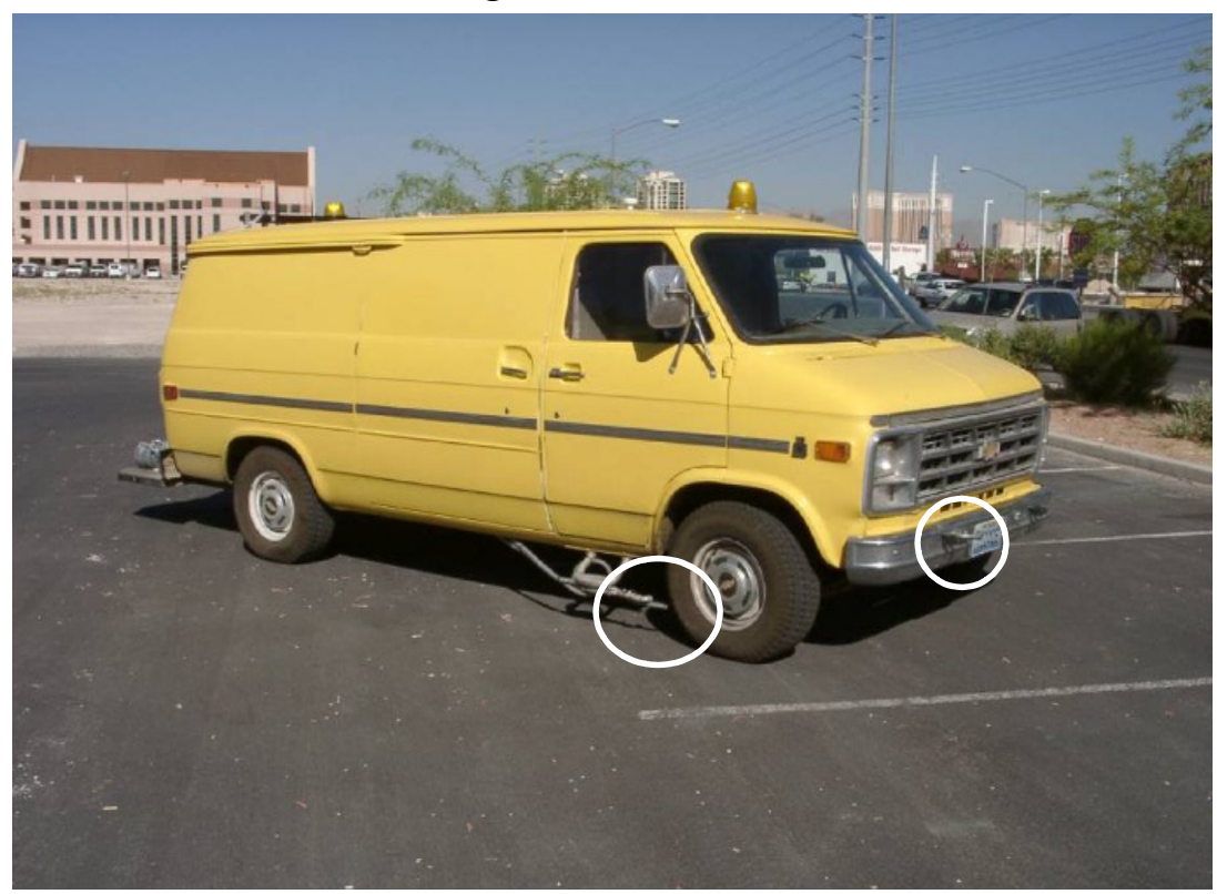
Figure 1. TRAKER I

There are currently two versions of DRI's mobile monitoring system, called TRAKER I and TRAKER II (Testing Re-entrained Aerosol Kinetic Emissions from Roads). TRAKER I is comprised of a van that is equipped with three exterior steel pipes acting as inlets for the onboard continuous particle monitoring instruments. Two of the pipes are located behind the left and right front tires and are used to measure emissions from the tires. The third pipe is the inlet for background air and runs along the centerline of the van underneath the body and extends through the front bumper. The background measurement is used to correct the measurements behind the tires for fluctuating dust and exhaust emission contributions from other vehicles on the road. Separate TSI, Inc. DustTraks (Model 8520) are connected to each of the left and right inlet lines as well as on the middle inlet line. A central computer collects all the data generated by the onboard monitors as well as GPS coordinates, and vehicle speed and acceleration with a 1-second frequency.