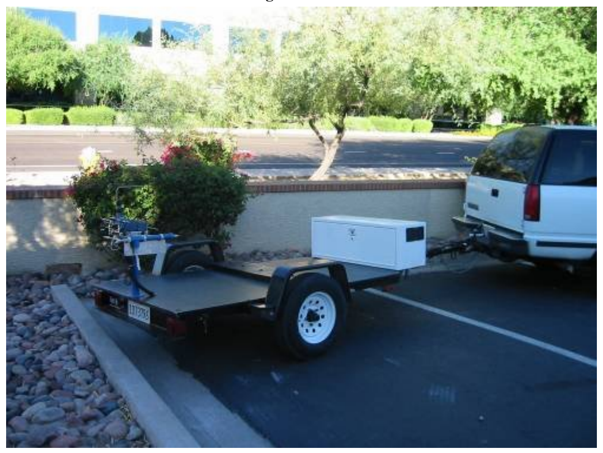
Figure 3. SCAMPER