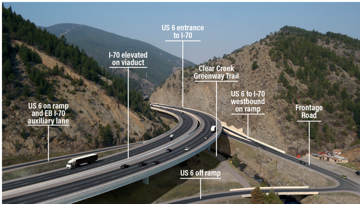
Figure 3: Simulation of the Canyon Viaduct Above Clear Creek Canyon

The construction of a new frontage road between the US 6 interchange and the Hidden Valley/Central City interchanges will provide route redundancy in the area in case of emergency. The added auxiliary lane on I-70 can provide additional capacity for emergency vehicles to move quicker in the corridor if general purpose lanes are congested. Improvements to the Clear Creek Greenway multimodal trail can also provide an alternate route for emergency personnel, if needed, and of course provides recreational opportunities for the public.