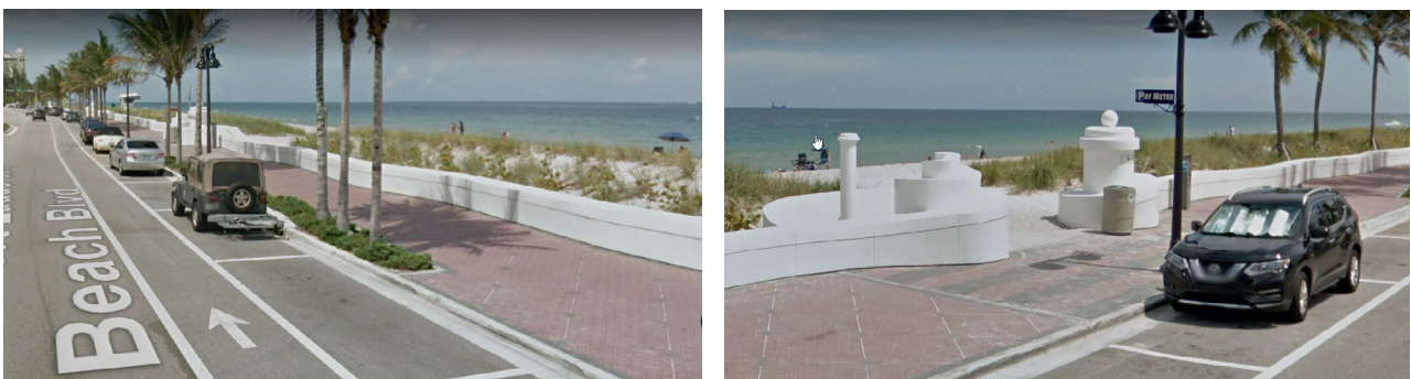
Figure 5: Sidewalk and Wall Improvements, Photos Provided by FDOT