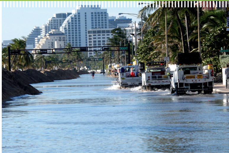
Figure 2: Flooded SR A1A (2012)

Protection from future storm surge and sea level rise was another key concern in project design. The new design added flood protection by adjusting its slope. The original road sloped toward adjacent homes. The new road is slightly elevated in the middle of the road. The new design now redirects stormwater runoff to storm drains on either side of the highway. The seaward side of the road was raised the maximum extent feasible while still maintaining access and harmonization with adjacent properties (this was not based on sea level rise projection or modeling). Traffic control boxes were raised onto concrete slabs to prevent water damage from flooding.