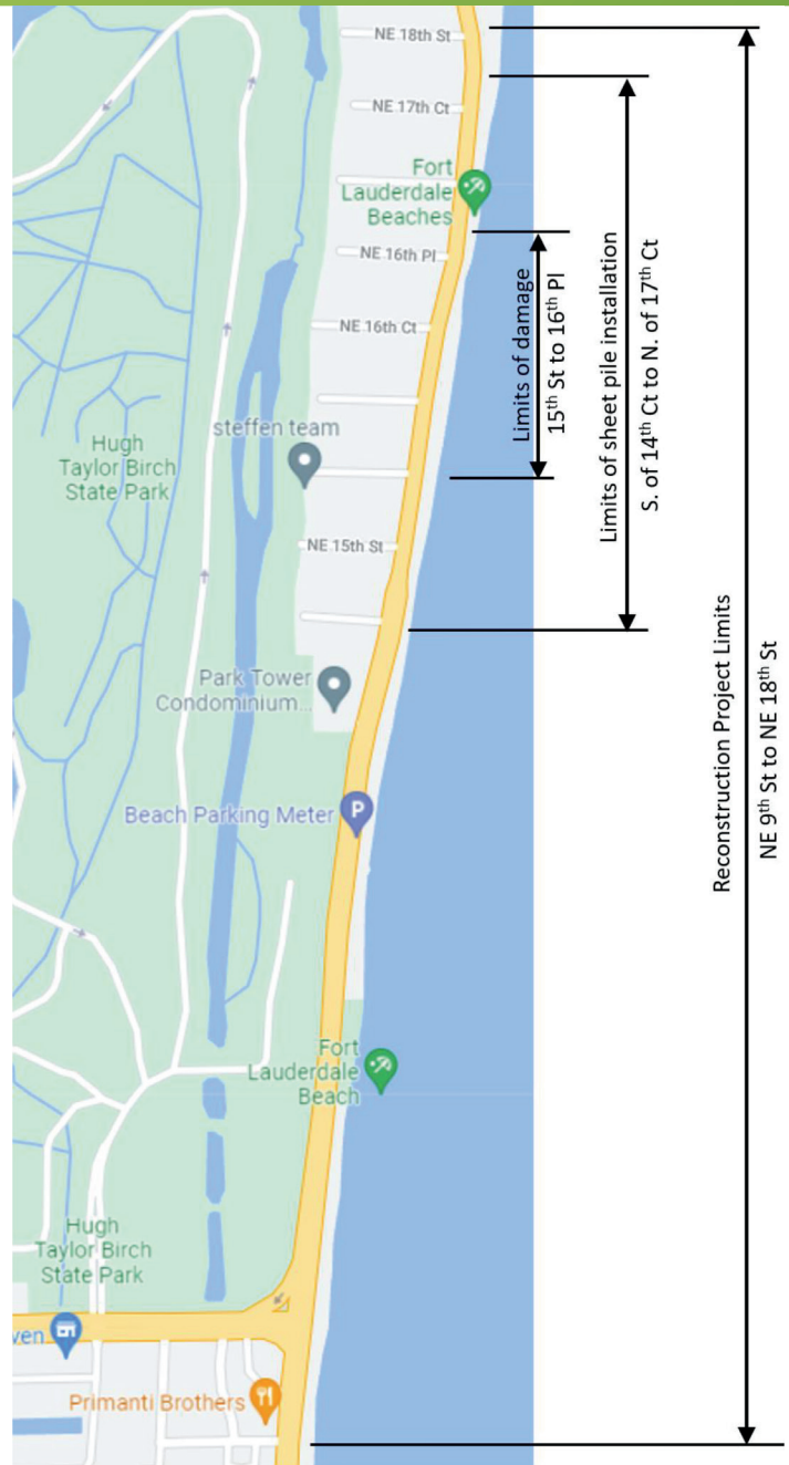
Figure 1: Project Boundaries