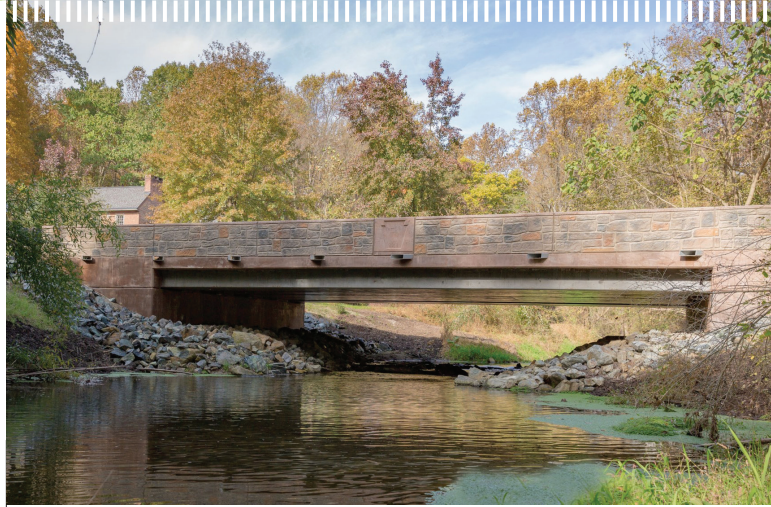
Replacement Bridge on Kirks Mill Rd over Reynolds Run, Lancaster County, Pennsylvania.

On DB projects, PennDOT typically completes the NEPA process prior to the completion of the conceptual plans. As a result, PennDOT has not experienced any noticeable difference in environmental clearance times between DB and DBB projects. For the RBR P3 project, through a SEP-15 approval from FHWA, PennDOT was able to shift the responsibility for obtaining all NEPA clearance and required permits to the private entity through a special arrangement with FHWA. While the RBR P3 project did experience a NEPA re-evaluation, it did not significantly impact the project schedule.