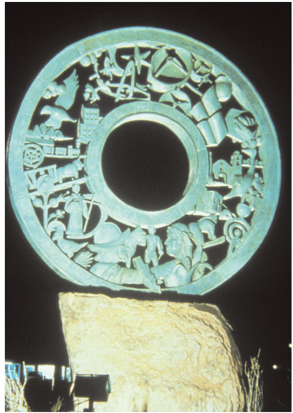
Right – A multicultural past is celebrated in this sculpture in the plaza at Socorro, New Mexico.