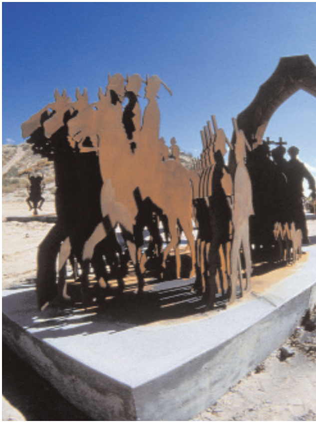
Left – Sculptures commemorating El Camino Real, the Royal Road and Tomé Hill.