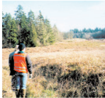
Right – The Washington State Department of Transportation protects water quality in the state by focusing on entire watersheds.

This unique agreement resulted in preservation of unique wetlands habitat, the remnants of rice plantations, a large colony of endangered red-cockaded woodpeckers, and archaeological sites—providing opportunities for visitors to experience the untouched natural environment and view relics of the past. Preservation of the island also preserved the culture of the island residents, a community descended from African-American plantation labor force, which has been in existence since 1865.